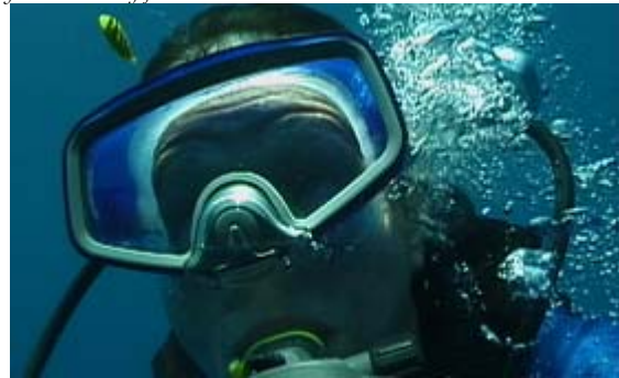
This guy stayed with me for more than half my dive