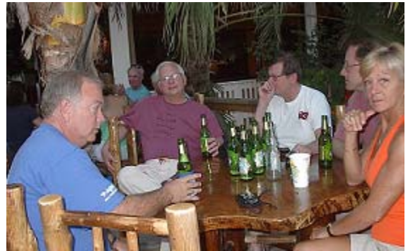
Happy Hour and the next pic, some more Happy Hour

Latch and inspect all compartment doors. Replace all worn or damaged parts. At the end of each day of diving, all underwater camera equipment must be soaked in fresh water to remove salt deposits. Keep everything sealed while rising. Never use detergents, cleaners, solvents or chemicals to clean your camera equipment. The mask bucket on a boat is full of detergent - DO NOT USE THE MASK BUCKET TO RINSE YOUR PHOTO EQUIPMENT. Let the water drain from all of your camera equipment and wipe with a soft dry towel (such as a chamois) until dry. Be sure that you and your camera equipment are dry before opening any doors. Always keep the compartment cover O-ring clean, dry and free from obstructions such as sand, lint or salt crystals. For prolonged storage remove all batteries and insert fresh "Moisture Muncher" desiccant capsules.