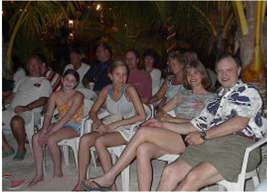
This night's beach entertainment was the Fire Dancers