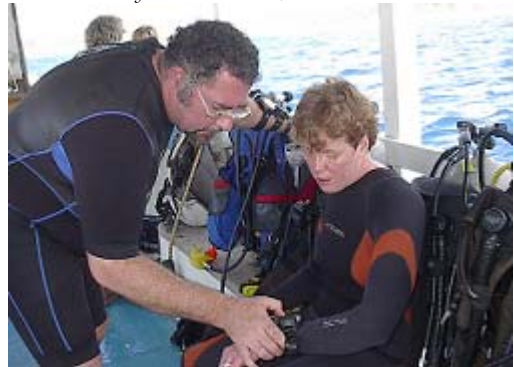
doing some last minute gear check