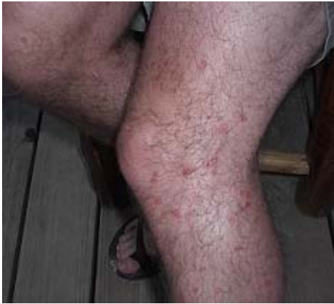
Are there any sand fleas in Roatan, Nathan?

can be used for washing the suit. Use wetsuit cleaner/conditioner (preferred) or warm water with a mild detergent. Push the suit up and down in the tub for about five minutes with all zippers open. After washing, all soap must be rinsed out. If your suit has an odor that soap cannot remove, use liquid sink guard (preferred) or a half a cup of baking soda in warm water and stir in well. Push the suit up and down occasionally and after about a half hour of soaking, rinse thoroughly (DO NOT put your suit in a washing machine.) If you are going to dry your suit on hangers, it is extremely important that you use an extra wide hanger. If narrow or wood hangers are used, the suit will be damaged due to excessive creasing. After the suit has dried, the zipper should be lubricated with zipper wax. □