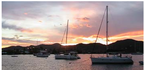
Just another day at the office...

If you still have an interest in going on this trip, it might not be too late. Check out our web site and see if this interests you. If so, then you need to contact me ASAP and see if it would be possible to get you on this one. We have to give up our extra rooms and air by November 17 th , but just maybe they might have a room for you. Air might be the only problem if we give all of ours up, but you never know.