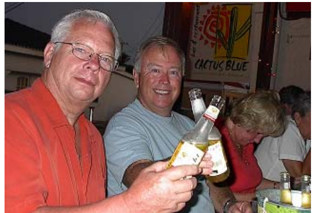
THE EAT AND DRINK CLUB

Develop a gallery of members' photos and video clip for website, start with emphasis on underwater scenes 🚩