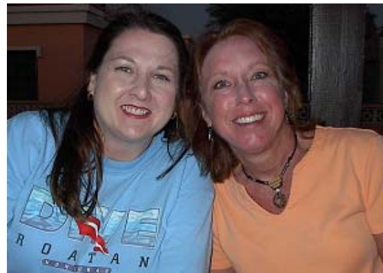
SOME OF MY ROOMMATES, DON'T TELL THE WIFE