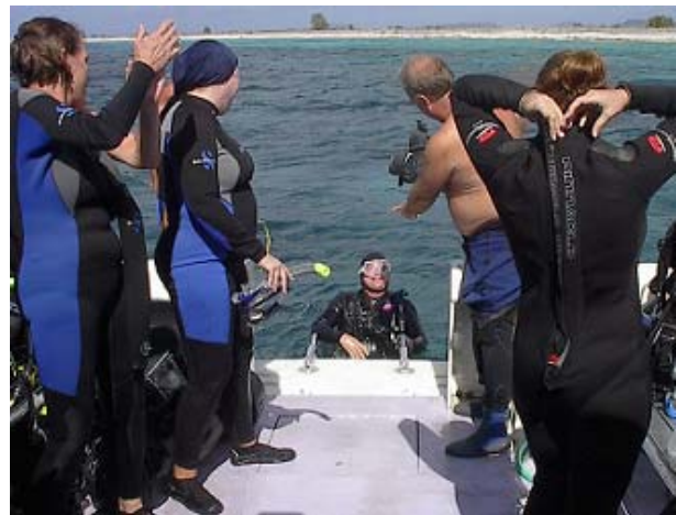
CHECK LIST: MASK, REG, WEIGHTS....FINS??

Here you go. Some of us went to Bonaire and for the pics in this issue; it will be some of the Editor's shots. So enjoy... 🚩