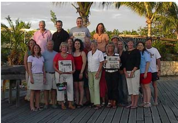
THE GROUP FROM BONAIRE