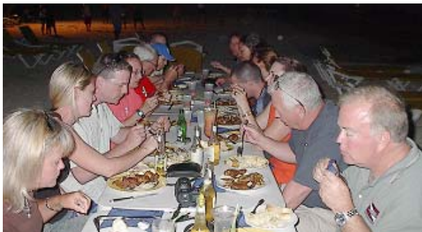
BBQ ON THE BEACH AT SUNSET

Although we did not finish the calendar, we did come up with some good locations for us to go diving. We will be meeting on March 20 th to finalize our calendar, if possible. We did decide to go ahead and announce the Utliia trip for Spring Break 2008 week. This should be a great location for all. They are in the process of building a large whale shark shaped in ground pool; so at least everyone that goes on the trip can say they saw a whale shark. We are looking into a trip for mid to late June for those not able to go to Grand Turk. We are also looking into Ft. Lauderdale and or Keys for late this fall, along with several lake and quarry dives this summer. I am impressed with the desire of this committee to work towards making this a better club. 🚩