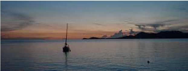
British Virgin Islands

Back by popular demand is the Dale Hollow dive trip the weekend of July 14 & 15. We have a 30 foot (double-decker) pontoon boat complete with slide and CD player reserved for the BGDC. The majority of folks will be camping and we have started making reservations on the "M" Loop. Three sites are reserved and 5 more are available on this loop. The minimum stay is 2 nights at $20.00 a night. For discounts see the site. Go to http://parks.ky.gov/reservations/ to reserve your campsite. For non-campers, I'm sorry to say that Dale Hollow State Park Lodge is full, but according to their website, cottages are available to rent nearby. As with previous years, we'll probably have a pot-luck type dinner Saturday night. Good eats and good company!