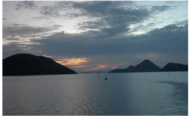
British Virgin Islands

Please send your email to both email accounts so that I see it and respond in a timely manner. 🚩