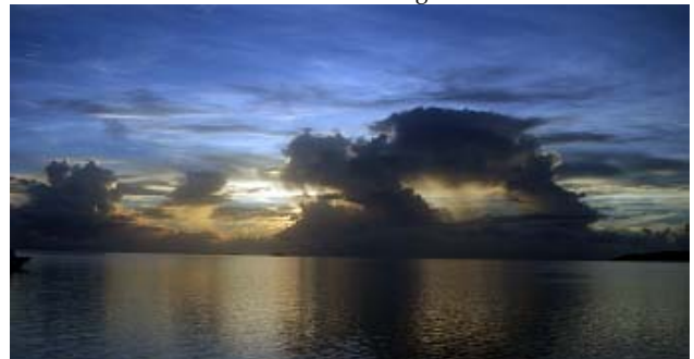
British Virgin Islands from Noel Hall